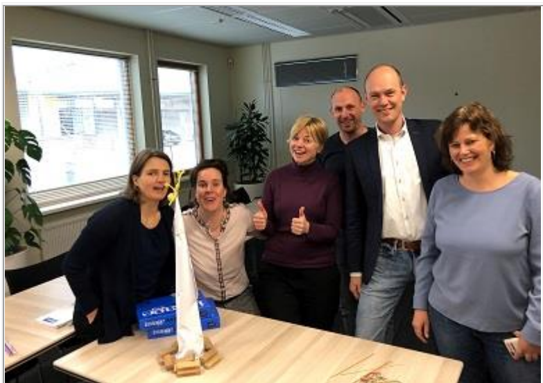
Delegates at the KM training course in the Netherlands, enjoying the Bird island exercise

Knoco Netherlands was recently involved in providing training to a local port authority. As always, the Bird Island exercise proved very successful.